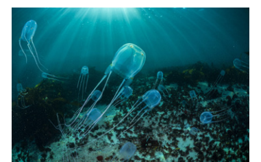
Box jellyfish and Irukandji

The above information is indicative in nature and general only. Always seek professional medical advice in the event of a venomous bite or sting.