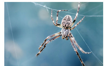
Other spiders (except funnelweb and big black spiders)