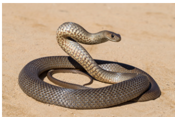
Australian snakes including sea snakes