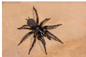
Funnelweb and big black spiders