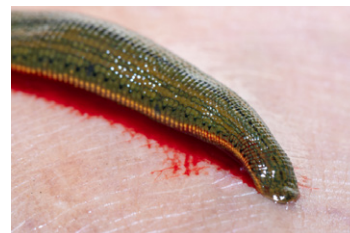
Leeches (remove leech and wash area first)