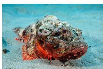
Stinging fish (including stonefish)